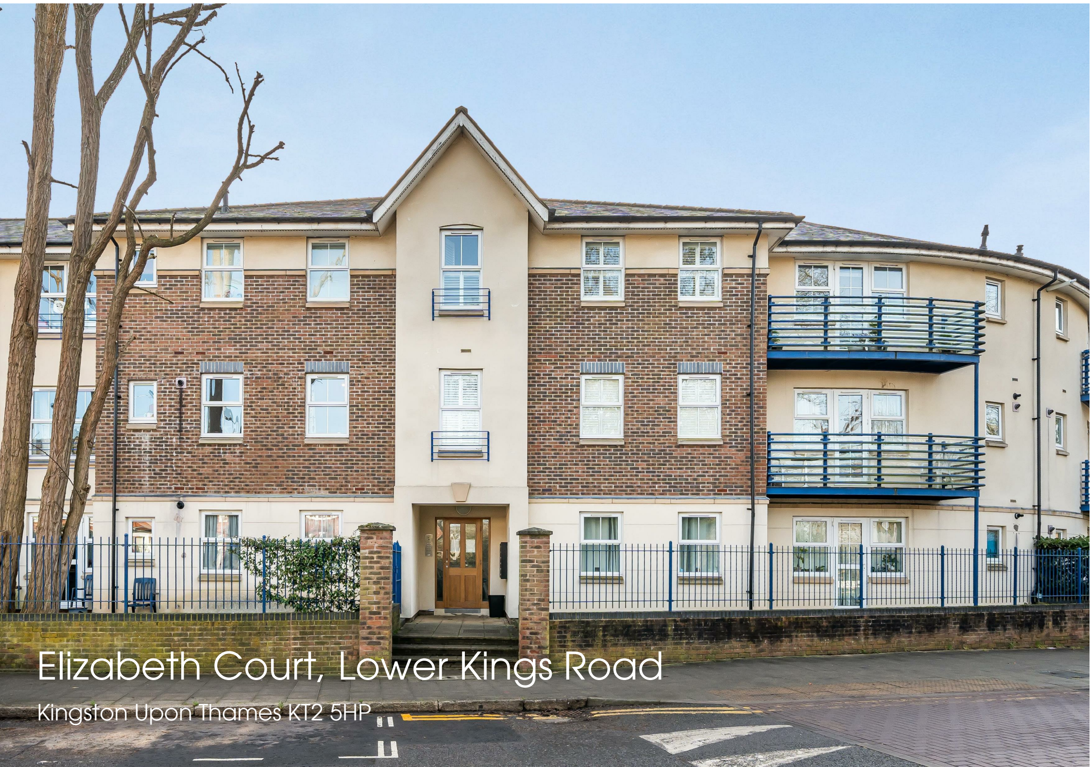
Elizabeth Court, Lower Kings Road Kingston Upon Thames KT2 5HP